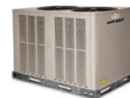
Single Circuit Condensing Units 6 to 20 tons