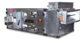
Destiny® Indoor Air Handlers 600 to 15,000 cfm