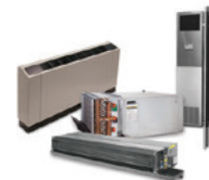
Fan Coils 200 to 3,000 cfm