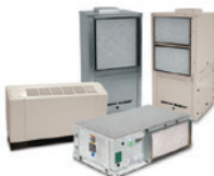
Water Source Heat Pumps ½ to 25 tons